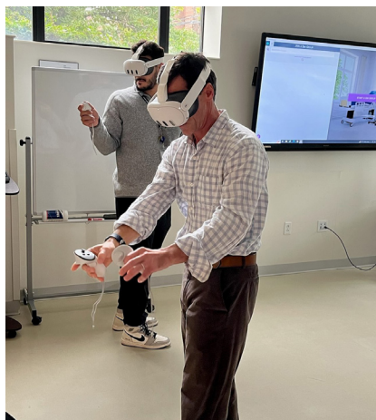
YCHS now has a virtual reality platform

Because clinicians all receive similar training, VR helps promote Yale New Haven Health’s Care Signature. Other advantages include realistic training, particularly for “patient unfolding cases,” in which a patient’s condition evolves. VR offers additional resources and simulation tools to help train clinicians to meet specific Joint Commission standards and could be used to collect safety and quality data and provide training to improve safety outcomes.